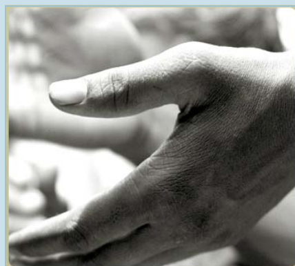
Adult Survivors of Sexual Assault Support Group

Meetings for the Adult Survivors of Sexual Assault support group are every 1 st and 3 rd Thursday from 5:30 to 7:00. Meetings will be held at the Mt. Pleasant Police Department's Victim Services Building at 309 Bank St. in Mt. Pleasant.